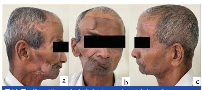
Table/Fig-11: a-c) Preprosthodontic treatment extraoral photographs

Postsurgical rehabilitation was not received by the patient, this resulted in the ramus segment migrating superiorly and medially and fibrosing, with limited mouth opening, making impressions a