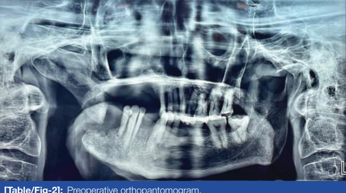
[Table/Fig-2]: Preoperative orthopantomogram